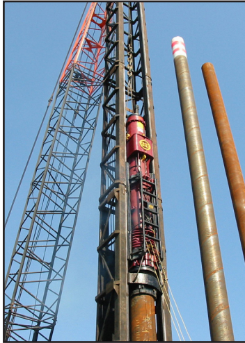
D36-42 in fixed leads.